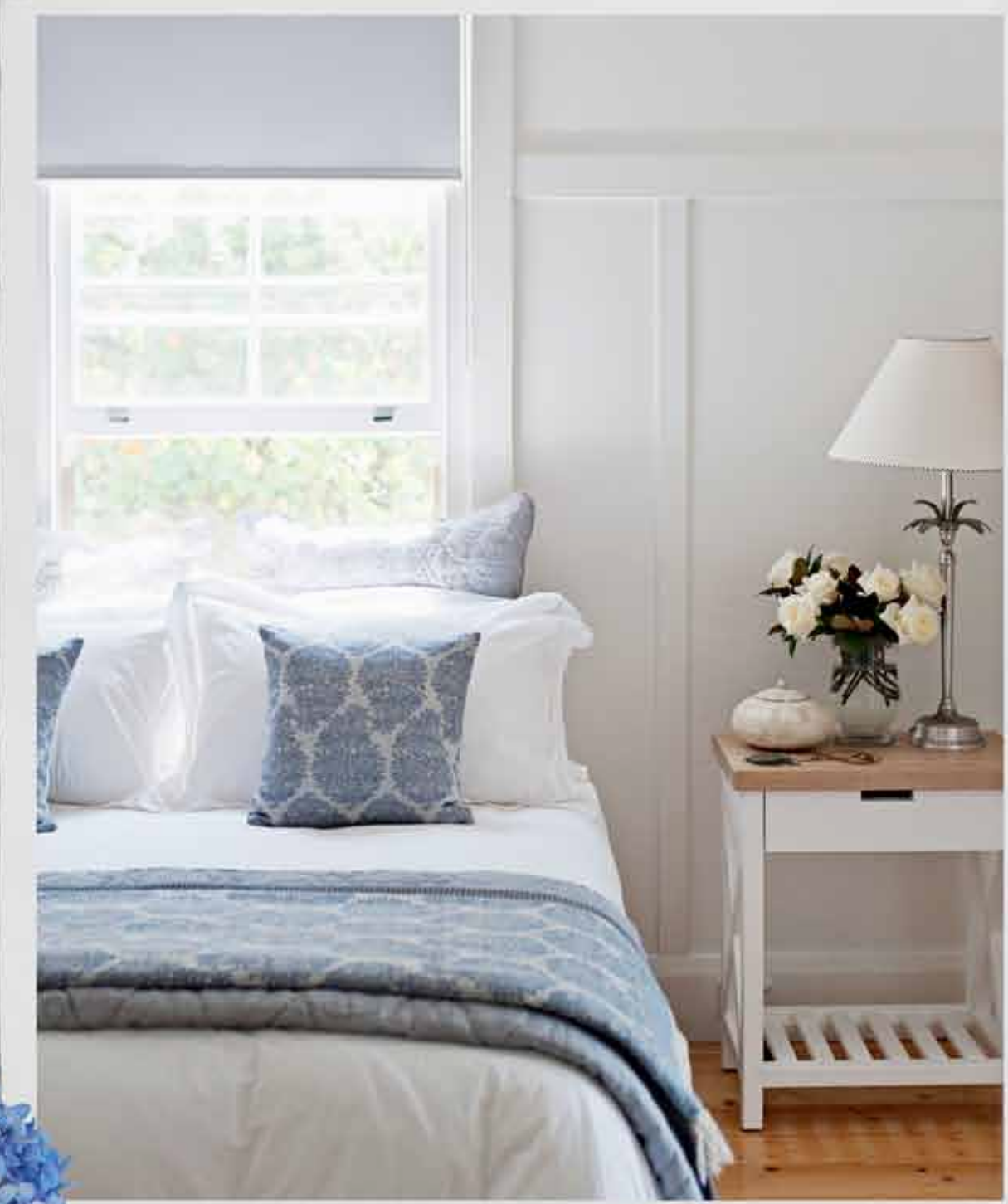
MASTER BEDROOM Peta and Greg's cool and calm bedroom is embellished with a Linen & Moore 'Boston' quilt and 'Bergomo' paisley throw. The bedside table and lamp, both Beachwood, tie in with the crisp white linen.