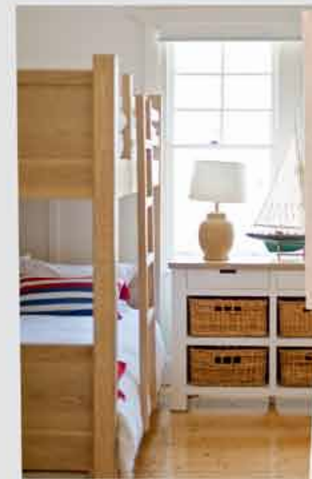
The kids' bunk room blends smart storage with nautical style.

Anything you would change or do differently next time around? "Not really – we're so happy here. If anything, just add a few more bedrooms so the kids don't have to share."